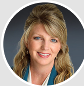
Senator Heather Cloud