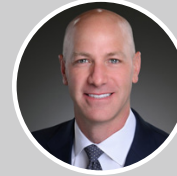
Senator Brach Myers