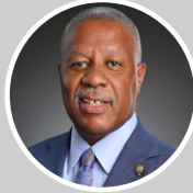
Senator Gerald Boudreaux