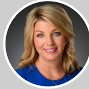
Senator Heather Cloud