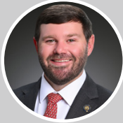
Senator Robert Allain