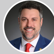
Senator Blake Miguez